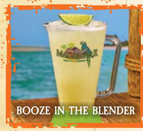
BOOZE IN THE BLENDER

Margaritaville Silver Tequila, Blue Curaçao, and our house margarita blend. Served on the rocks (280 calories)