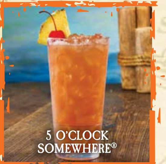
5 O'CLOCK SOMEWHERE®

Myers's® Original Dark Rum blended with blackberry and banana purées, and topped with Cruzan® Hurricane Proof Rum. Served frozen (310 calories)